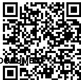
QR CODE FOR THE DIGITAL

Located on the ground floor, from 7:30 a.m. to 11:00 p.m. (closed at night)