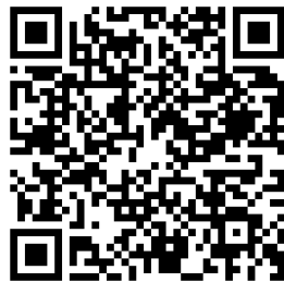
QR CODE FOR THE DIGITAL DOCUMENT

Located on the ground floor, from 7:30 a.m. to 11:00 p.m. (closed at night)